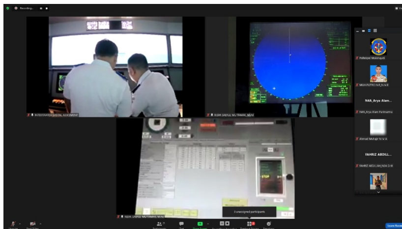
Figure 2. The lecturers are preparing the lesson