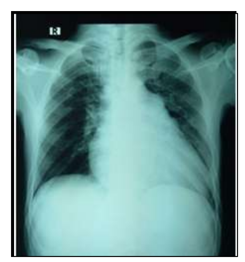
Figure 1. Chest X-Ray

Chest X-ray resulted in cardiomegaly, as shown in Figure 1 below.