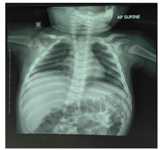
Figure 1. Chest X-ray

A 9-month-old male patient with a body weight of 6.1 kg entered the emergency room with a reduction in awareness by diagnosing brain abscesses. Patients are diagnosed with a patient's brain abscess from birth. A history of fainting was denied, a history of seizures was denied. A history of fever is denied. History of trauma is denied. Patients experience difficulties during labor. Obstetric history, the patient is the first child, when the patient is experiencing cyanosis, apnea and cardiac arrest.